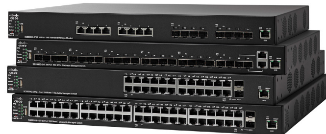
Figure 1. Cisco 550X Series Switches

Cisco 550X Series Stackable Managed Switches (Figure 1) offer the flexibility you need to meet your business requirements. These switches offer 24- to 48-port Gigabit or Fast Ethernet with 10 Gigabit uplinks, and 16- to 48-port 10 Gigabit Ethernet with both copper (10GBase-T) and fiber (Small Form Factor Pluggable Plus [SFP+]) options.