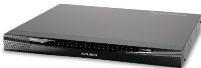
● Front view